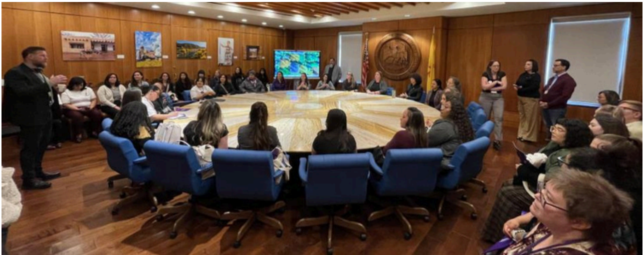
Pictured: social work students in the Governor's Office during 2025 SANA Day at the Legislature

On February 6, 2026 social work students from across New Mexico will meet at the State Capitol Building in Santa Fe to participate in Student Advocacy & Action (SANA) Day at the Legislature .