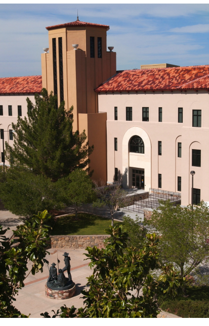
College of Health and Social Services